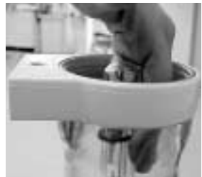
Figure 16 Removing lower O-ring